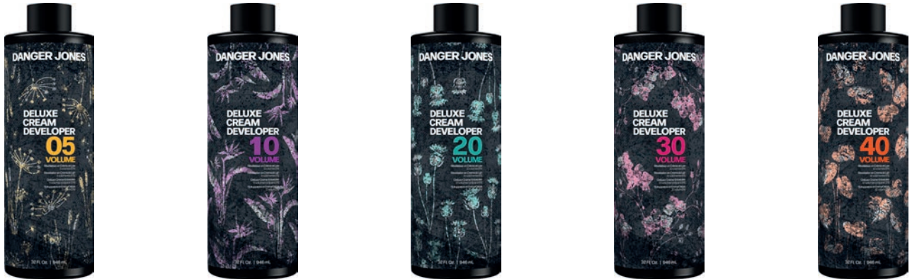
5 Volume 19484

Deluxe Cream Developer Creamy consistency & active ingredients of Jojoba Seed Oil & Aloe Leaf Juice help provide extra moisture when mixed. Specifically designed to pair with Danger Jones Powder Lightener & Color Remover. 100% vegan & gluten free. No animal testing. 946ml