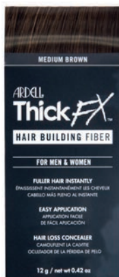
Medium Brown 12980