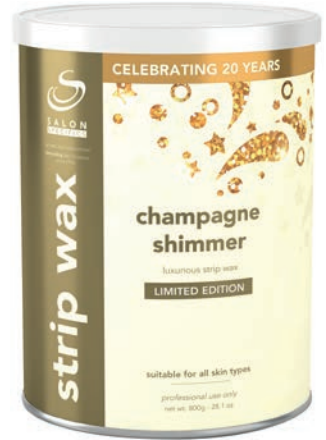
Champagne Shimmer 14674