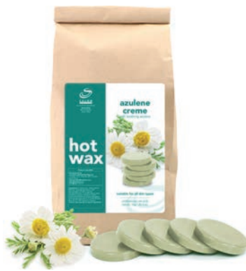
Azulene Crème Specially suited for removing short, stubborn hairs. Ideal for bikini, underarm & facial areas. 1kg (disks) 18403