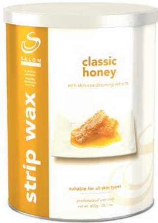
Classic Honey 2793

Extremely quick method of hair removal, removes even the shortest hairs, applied thinly with direction of hair & removed with strip in opposite direction. 800g