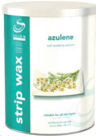
Azulene Odor-free, soothing for sensitive skins & first time waxers. 2795