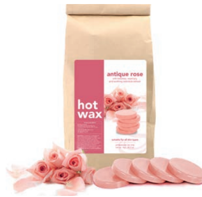
Antique Rose With beeswax, rosemary & soothing calendula extract. 1kg (disks) 18404