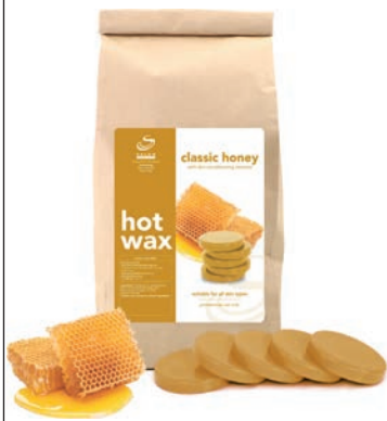
Classic Honey With skin-conditioning extracts. 1kg (disks) 18402

Especially suited to removing short, stubborn hairs, ideal for bikini, underarm & facial areas. Wax is applied against hair growth & peeled off in opposite direction.