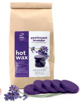
Pearlescent Lavender With beeswax & harmonizing lavender oil. 1kg (disks) 18405