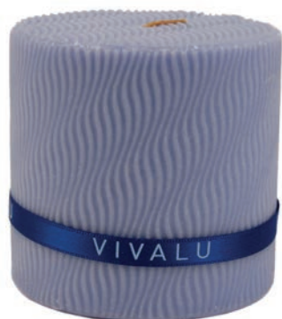
Blue Macadamia, Jojoba Oil & Soy Butter, this candle gives your senses the feeling of water & earth around you. When used in a massage you are revived & confident. 11456

These candles are rich in nutrients for skin, & are made fluid & useable by the lit flame. In addition to the natural moisturizing action of the oils, the perfume contained in the formula plays an aromatherapy role of balance.