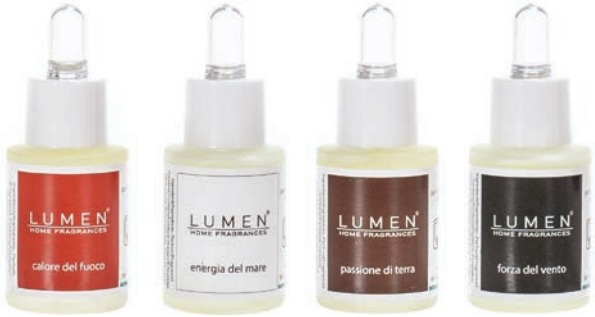
Fire (Red) 16137 Sea (White) 16138 Earth (Brown) 16139 Wind (Black) 16140

Glass Sphere, Large, 16cm For candles (32 hour) 10875