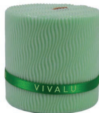
Green Juniper, Thyme, Benzoin & Cloves essential oils make up a natural, earthy candle which leaves you fresh after a relaxing massage. 11458