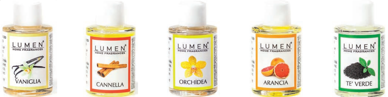
Vanilla 10876 Cinnamon 10877 Orchid 10878 Orange 10879 Green Tea 10880