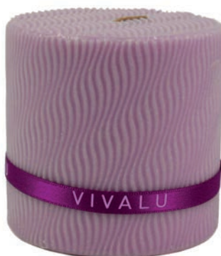
Red Rice & Bio Cartam Oil in Coconut & Shea Butter Mousse, will take your senses to a tranquil place of relaxation & meditation. 11457