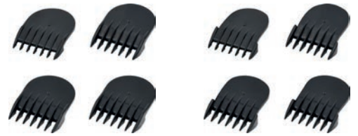
Spare Attachment Comb Set 18527