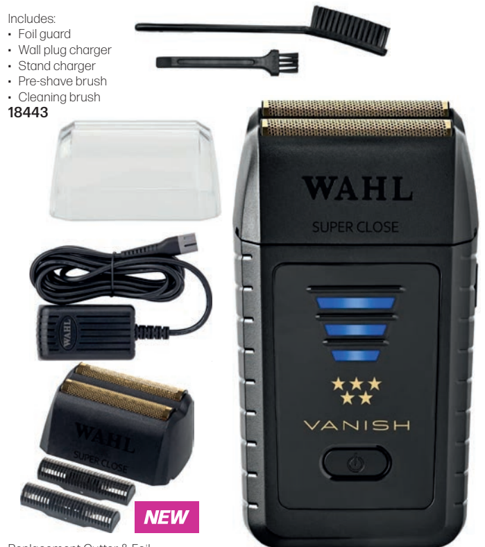
Replacement Cutter & Foil 20056