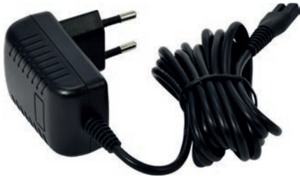
Adaptor Plug 18526