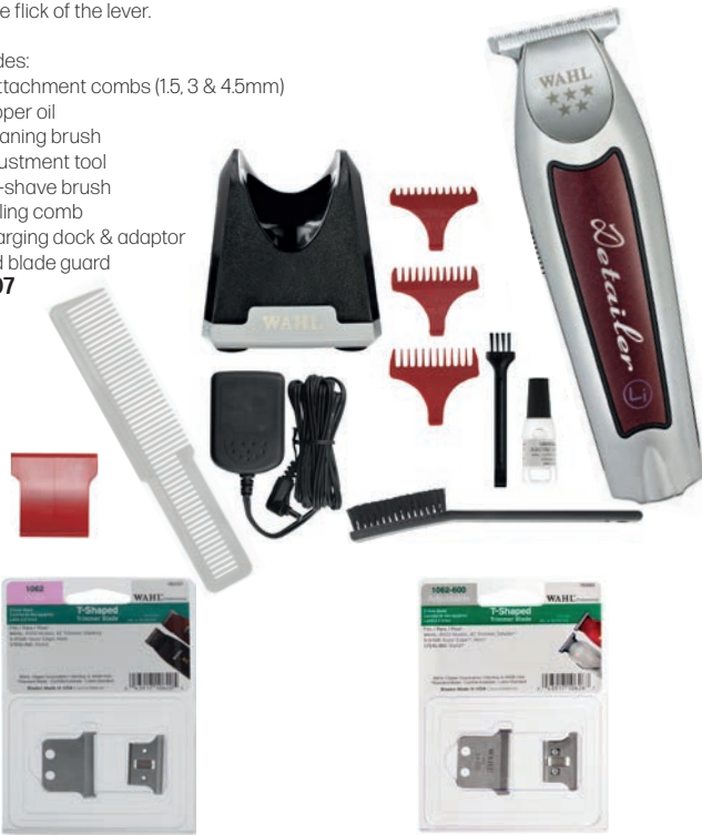
Wahl Detailer Trimmer Blade Set T-Shaped 16330