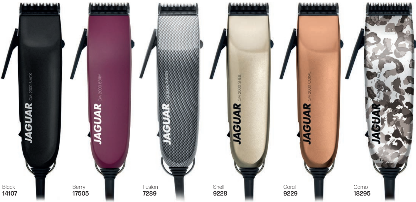
Black 14107 Berry 17505 Fusion 7289 Shell 9228 Coral 9229 Camo 18295

Hair clipper for mains operation, equipped with a powerful, extremely low-noise, bipolar swing motor. Precision cutting blades for exceptional sharpness & a long service life, with fast assembly system for the cutting blades. They are easy to fix simply by positioning them without alignment. Infinitely variable settings for cutting length from 1 to 2mm. Includes 6 attachment combs (3, 6, 9, 12, 19 & 25mm) & maintenance set.