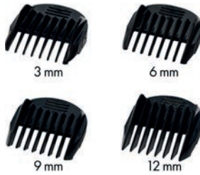
Spare Attachment Comb Set 18530