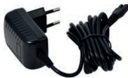
Adaptor Plug 18526