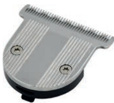
T-Blade Cutting Head 18525