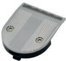
Cutting Head 18524