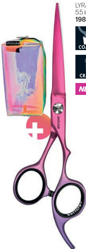
LYRA 5.5 inch 19838