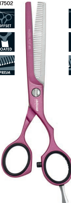
BERRY 5.25 inch LEFT 18294