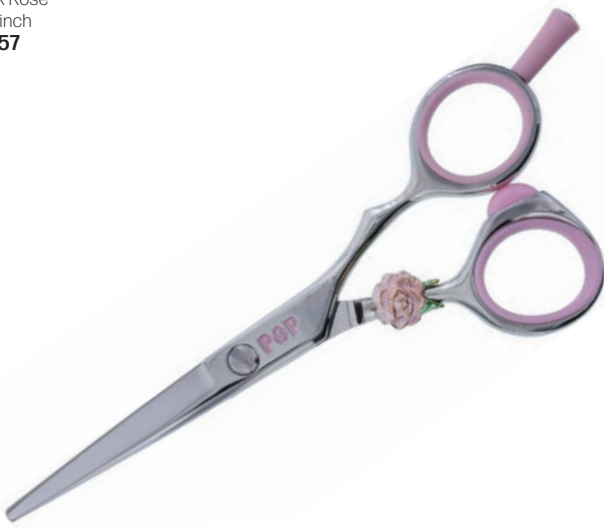
Pink Rose 5.0 inch 6957