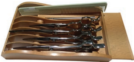
Scissor Stand A resting place for your scissors to keep them safe. NB: Tools not included. 15615