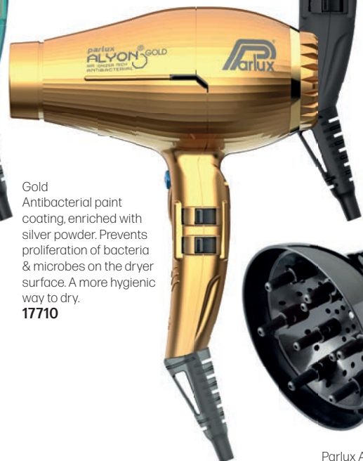
Gold Antibacterial paint coating, enriched with silver powder. Prevents proliferation of bacteria & microbes on the dryer surface. A more hygienic way to dry. 17710