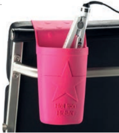
Hot Iron & Tong Holster, Hot Pink A professional heat-resistant silicone holder for hot styling tools - designed for the professional stylist. Heat-resistant to 260°C. 8976