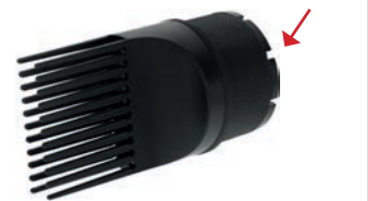
Smart Universal Dryer Comb with Silicone Nozzle Perfect for thick hair. 11062