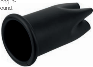
Straightener & Tong In-Bench Holder, Round, Black, 5cm Diameter 3276