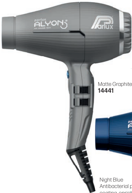
Matte Graphite 14441