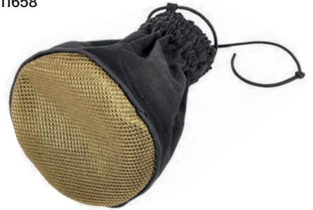
Hot Sock Diffuser 11658