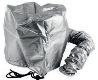
Bonnet Attachment for all Hair Dryers 9374