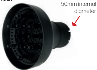
Smart Universal Diffuser with Silicone Nozzle 11327