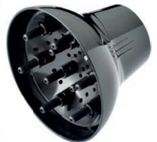
Parlux Alyon Diffuser 14634