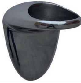
Wall Mounted Hair Dryer Holders Brushed Aluminium 4576