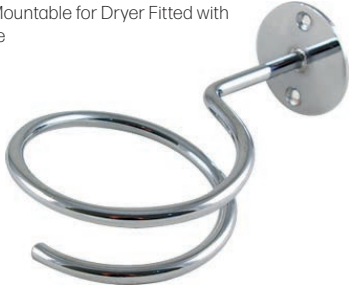
Wall Mountable for Dryer Fitted with Nozzle 3749