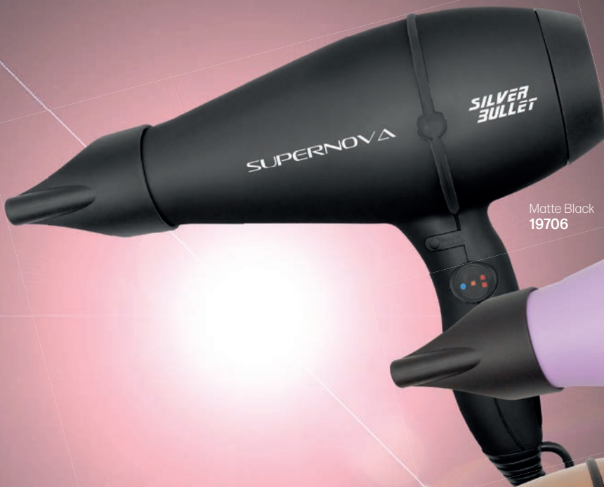
Matte Black 19706