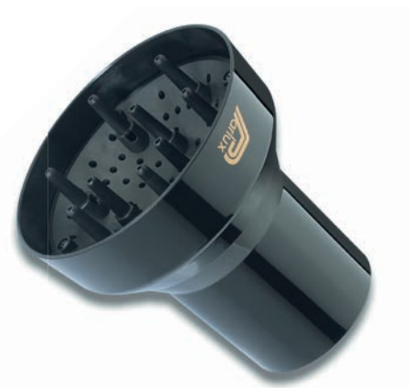
Diffuser for 3200 PLUS 15630