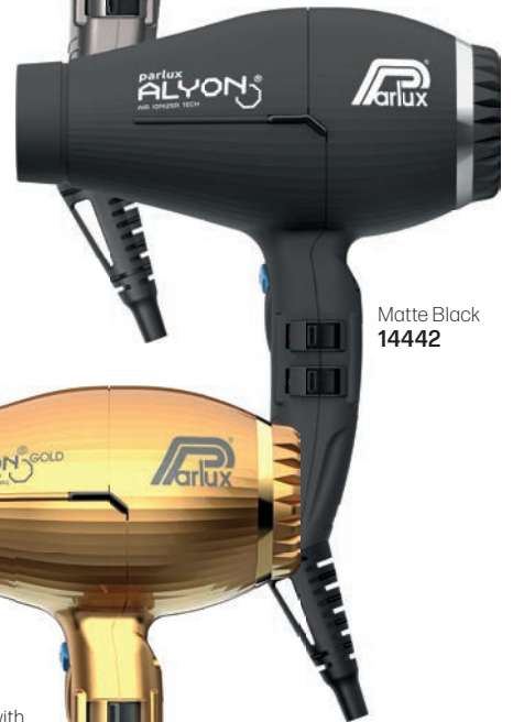
Matte Black 14442