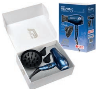
Night Blue Antibacterial paint coating, enriched with silver powder that prevents the proliferation of bacteria & microbes on the dryer surface. A more hygienic way to dry. 16608