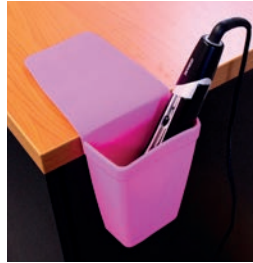
Holster for Retail & Home Use Hot Pink 9053 Purple 9054