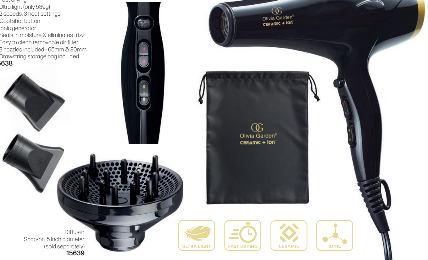
Diffuser Snap-on, 5 inch diameter (sold separately) 15639