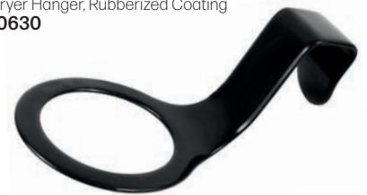
Dryer Hanger, Rubberized Coating 10630