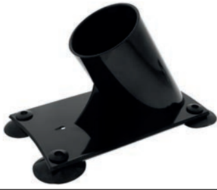
Plastic Dryer Holder with Suction Cups 1145