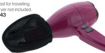
Soft Mitt Diffuser Ideal for travelling. Dryer not included. 1143