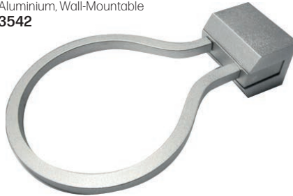
Aluminium, Wall-Mountable 3542