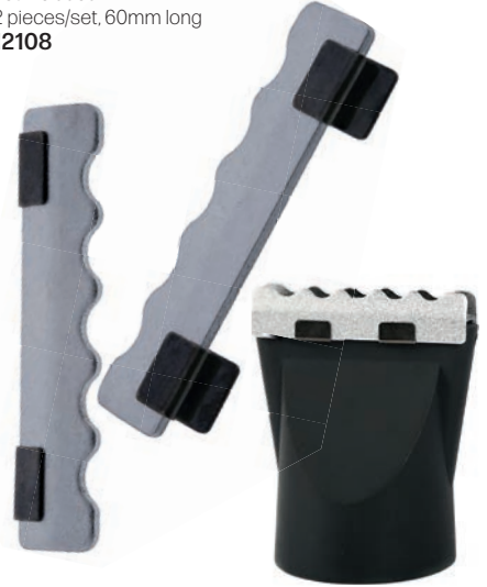
Slimline Nozzle Attachment Clips on any nozzle for any dryer, in order to direct the heat onto the hair. For smoother blow-drying. NB: nozzle not included. 2 pieces/set, 60mm long 12108