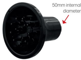
PIK Universal Diffuser 4401