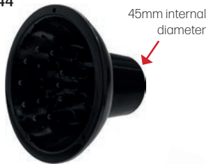
Universal Diffuser Fits most dryers. 1144