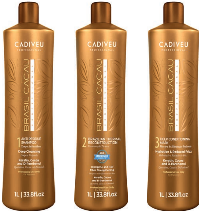
Step 1 Anti-Residue Shampoo 1 Litre P997

Professional Kit Step 1, 2 & 3 Includes 3 x 1 Litre P999