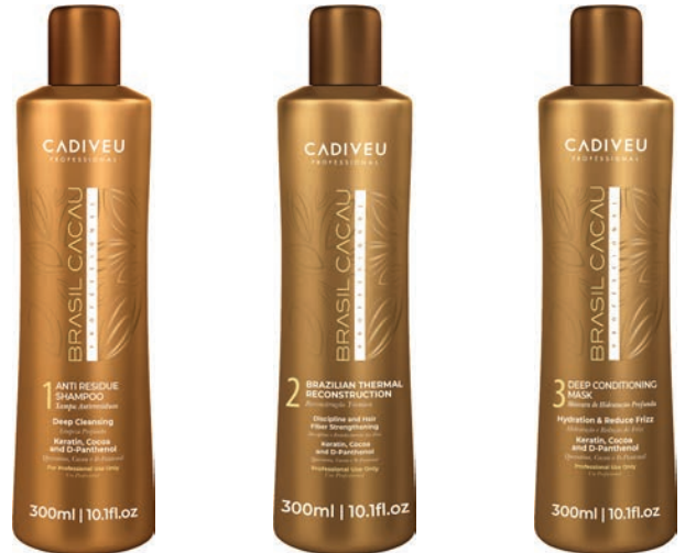
Step 1 Anti-Residue Shampoo 300ml P982

Professional Kit Step 1, 2 & 3 Includes 3 x 300ml P977