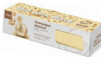
Champagne Shimmer With skin-soothing extracts. 17125