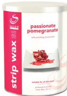
Passionate Pomegranate Non-crystallising. 9066