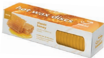
Classic Honey With skin-conditioning extracts. 17124