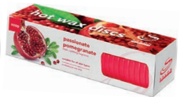
Passionate Pomegranate With fresh, uplifting fragrance. 17126