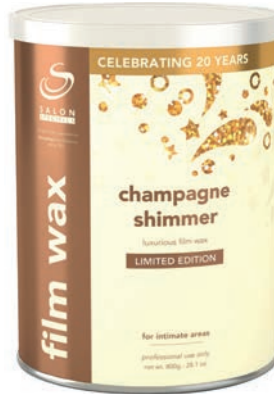
Champagne Shimmer Film Wax 800g 14673