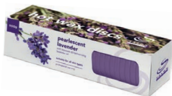
Pearlescent Lavender With beeswax & harmonising lavender oil. 17127