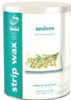
Azulene Odour-free, soothing for sensitive skins & first time waxers. 2795