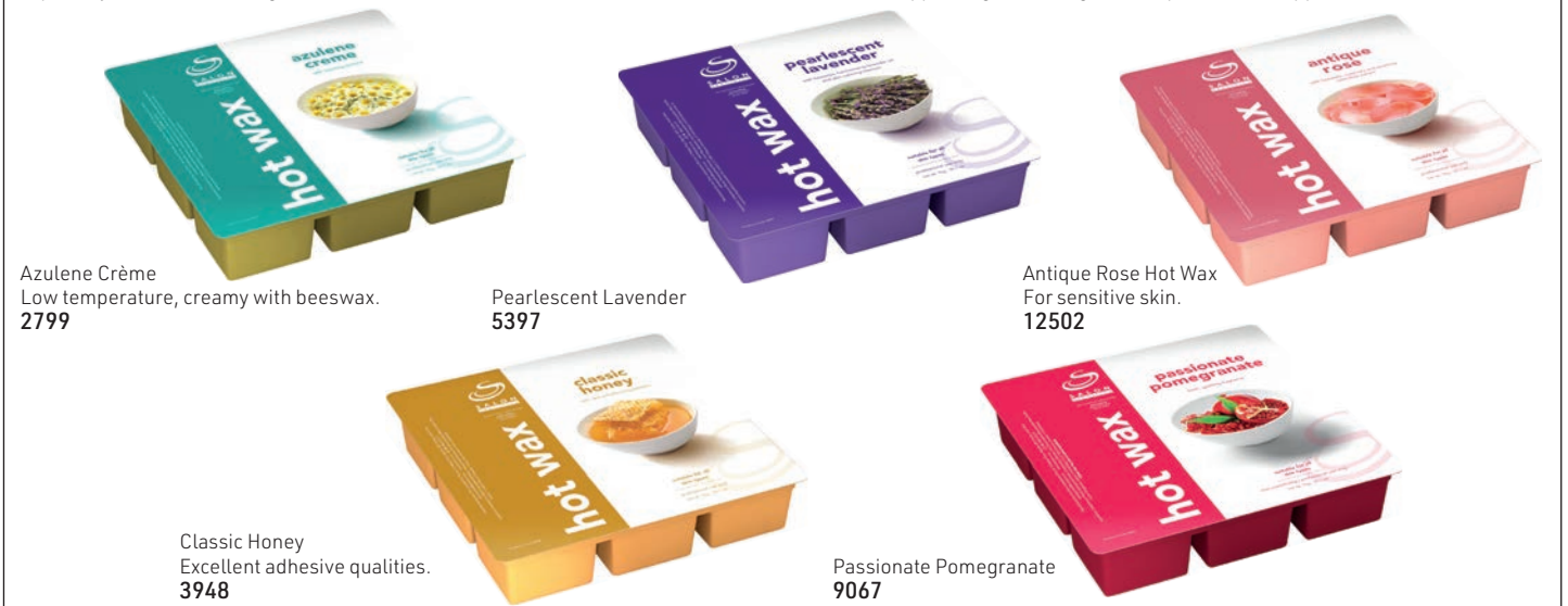
Azulene Crème Low temperature, creamy with beeswax. 2799

Especially suited to removing short, stubborn hairs, ideal for bikini, underarm & facial areas. Wax is applied against hair growth & peeled off in opposite direction.