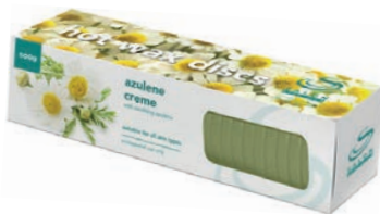
Azulene Creme With supremely soothing azulene. 17123