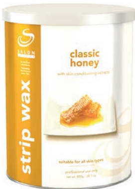
Classic Honey Suitable for all skin types. 2793

Extremely quick method of hair removal, removes even the shortest hairs, applied thinly with direction of hair & removed with strip in opposite direction