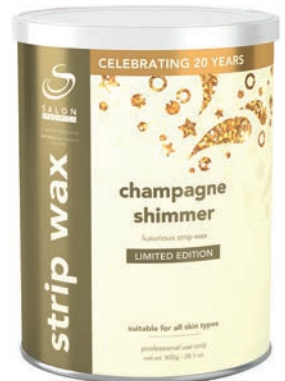
Champagne Shimmer 14674