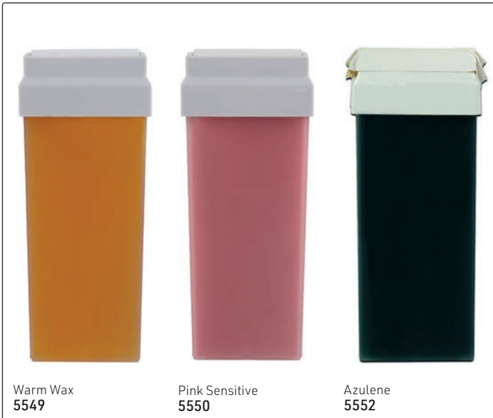
Warm Wax 5549