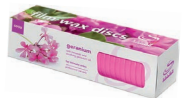
Geranium With beeswax & soothing geranium oil. 17129