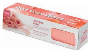
Antique Rose With beeswax, rosemary & soothing calendula extract. 17128