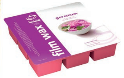
Hot Film Wax, Geranium The latest hot wax, applies like Strip Wax, sets like Hot Wax, perfect for Brazilian & underarm waxing. 1kg 2812