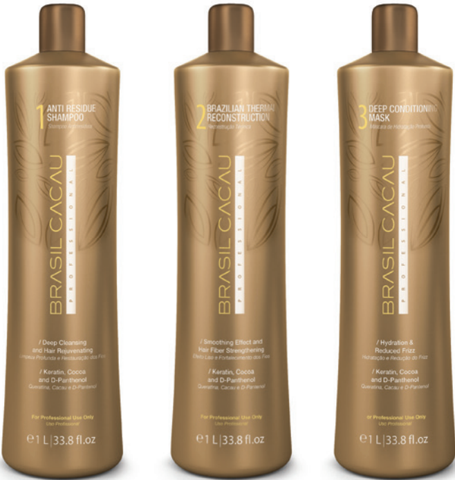
Step 1 Anti-Residue Shampoo 1 Litre P997 Step 2 Thermal Reconstruction 1 Litre 6005 Step 3 Deep Conditioning Mask 1 Litre P996

Professional Kit Step 1, 2 & 3 Includes 3 x 1 Litre P999