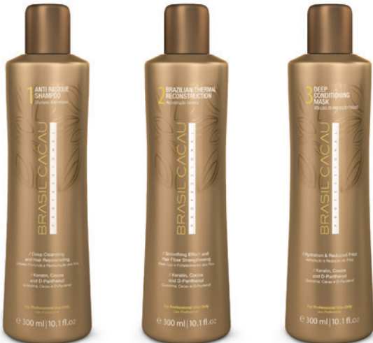
Step 1 Anti-Residue Shampoo 300ml P982 Step 2 Thermal Reconstructor 300ml 12051 Step 3 Deep Conditioning Mask 300ml P981

Professional Kit Step 1, 2 & 3 Includes 3 x 300ml P977