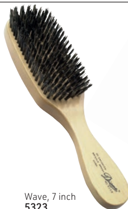
Wave, 7 inch 5323