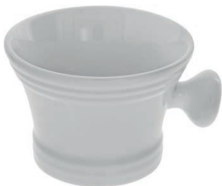
Porcelain Shaving Bowl 13661