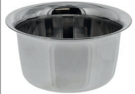
Dish for Barber Soap 3834