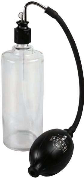
Cologne Atomizer 16121