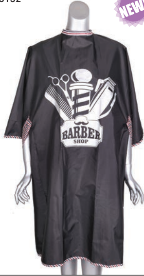
Barber Shop Polyester Cape with Arm Holes, Studs 15132