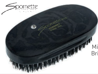
Cabaret Military Firm Bristle Brush 3078