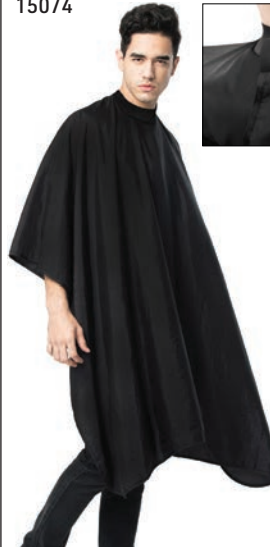
Cape, Nylon, Neoprene Collar, Water- Resistant, Studs. Keeps hair from slipping into clothing 15074