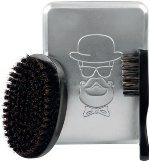
Beard & Moustache Grooming Kit 11986