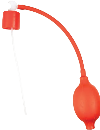
Spare spray 16122