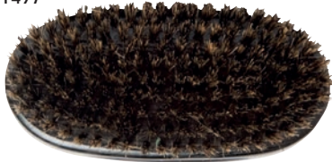
The Original Palm brush, 9 row 11497