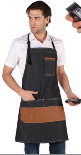
Barber Denim Apron 15065