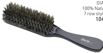
DIANE 100% Natural 7 row styling 10417