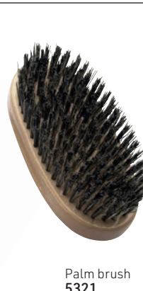
Palm brush 5321