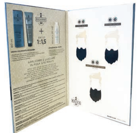
Beard Color Chart 16114