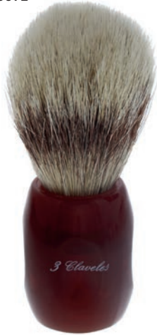
Horse Hair 3092