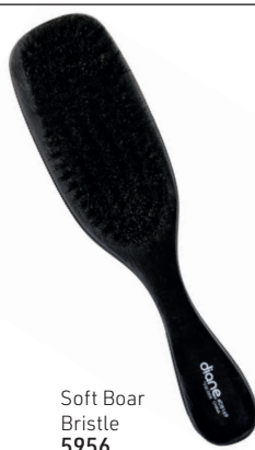
Soft Boar Bristle 5956