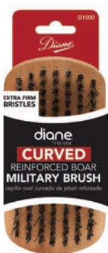
Extra Firm Boar, no handle 14898