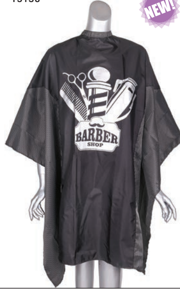
Barber Shop Polyester Cape, Panels, Pinstripes, Black & White 15136