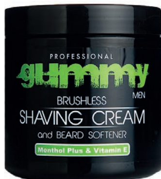
Vitamin E & Menthol Plus 14585

Gummy Bump Repair, 100ml For treatment of razor bumps & ingrown hair. This product cleanses skin & removes the accumulated dirt & oil. Contains salicylic acid to help heal painful, irritated bumps & prevents the formation of acne by opening the pores filled with dirt & oil. 14586