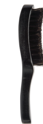
Soft Boar, with handle 14901