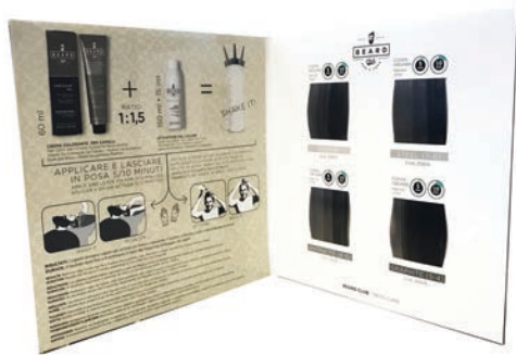
Hair Color Gel Colour Chart 16109