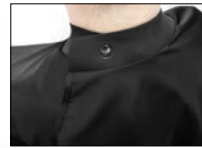
Cape, Nylon/Polyester Blend Studs, Water-Resistant 15075