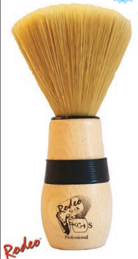
Neck Brush Synthetic Bristles 15834