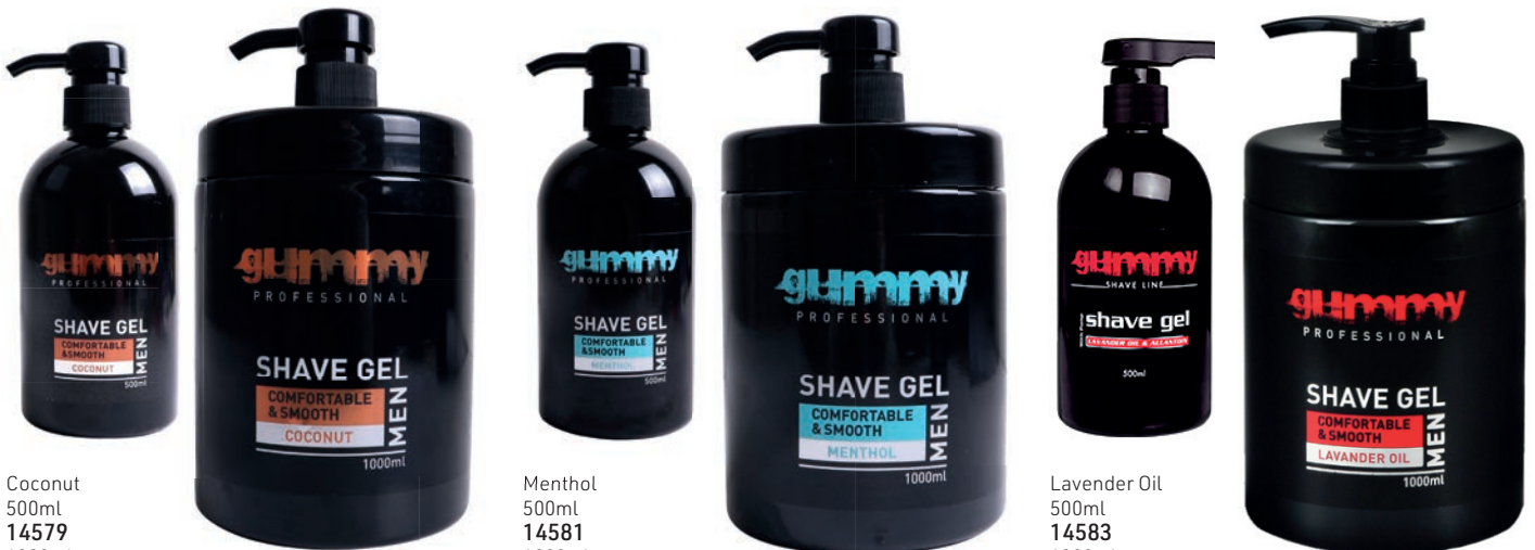
Coconut 500ml 14579 1000ml 14578

Gummy Shave Gel with Pump Provides comfortable & easy shaving of beard. Easy glide for razor blade.