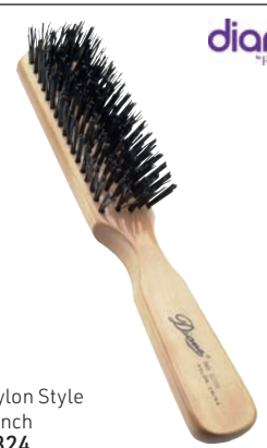
Nylon Style 9 inch 5324