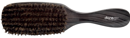
The Original Wave Brush, 7 row 11499