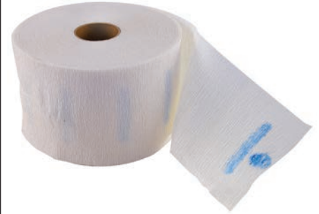
Neck paper Expandable, adhesive, hygienic, waterproof, 100 pieces per roll, 5 rolls 2777