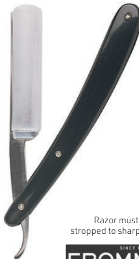
Facial razor 5292