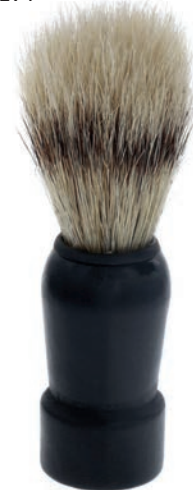
Faux Badger Hair 5294