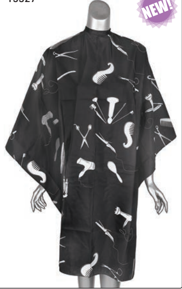
Cape with Tool Motif, Polyester, Studs Black 15327