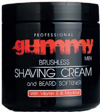
Vitamin E & Menthol 14584

Gummy Shaving Cream, 500ml Provides a comfortable shaving performance. Prepares skin for the shave. Helps to protect skin against irritation from the blade. Use as a beard softener. No brush needed.