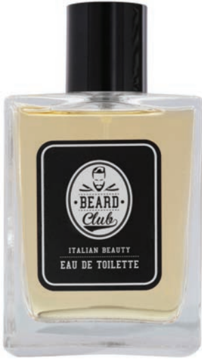
Eau De Toilette, 100ml 16115