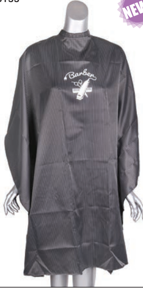
Barber Polyester Cape, Pinstripes, Studs, Black & White 15133