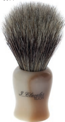
Badger Hair 3091