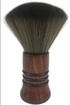
Shaving Brush, Soft Bristles 15339