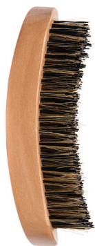
Extra Firm Boar, no handle 14898