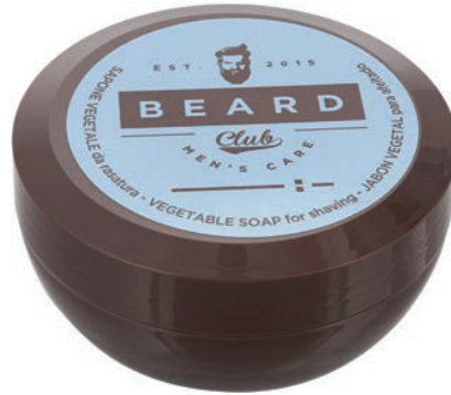
Vegetable Soap, 150ml 16116