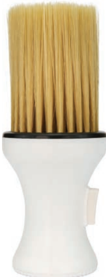
Neck Brush, Nylon Bristles 15340