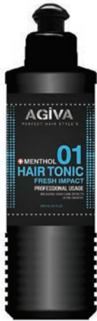
Menthol 01, 250ml 15116

Hair Styling Powder Dust - Provides volume, texture & matte effect with stability to last throughout the day. Prevents accumulation of oils on the scalp & hair. Apply on dry hair & style.