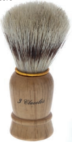
Sow Hair 3093