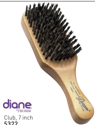
Club, 7 inch 5322