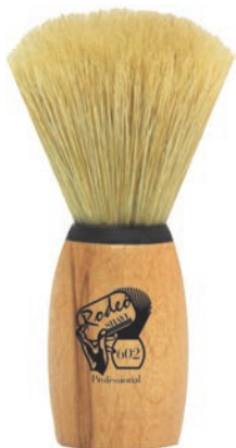
Shaving Brushes Small 15835