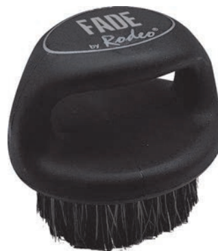
Fade Brushes Soft, yet firm bristles that remove cut hair to clearly define fade work, without hair sticking to the scalp, helping to identify any imperfections. Handle 15837