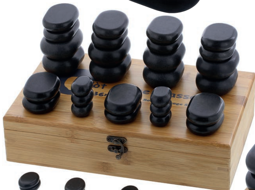
Massage Set (x36) Stones - consist of: - 8 large - 14 medium - 6 small - 8 toes 6725