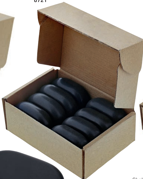
Large Oval (x 8) 6721