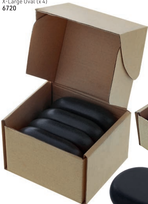
X-Large Oval (x 4) 6720