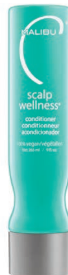
Conditioner, 266ml 15611