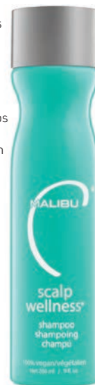
Shampoo, 266ml 15608