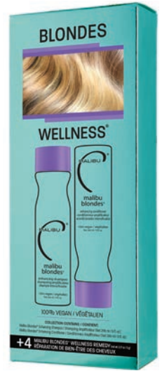
Collection (Shampoo & Conditioner + 4 Blondes sachets) 15961