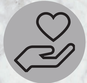
COLOUR PROTECT COMPLEX