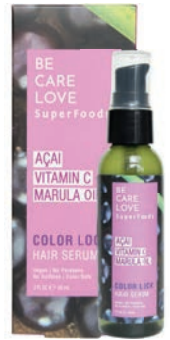
Serum 60ml 15657