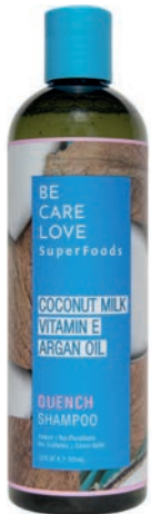
Shampoo 355ml 15648