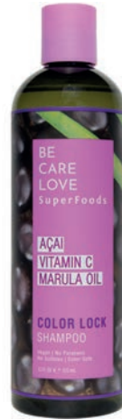
Shampoo 355ml 15649