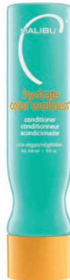
Conditioner, 266ml 15046