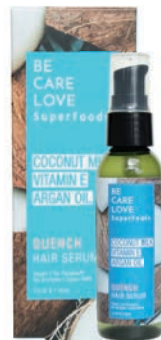
Serum 60ml 15656