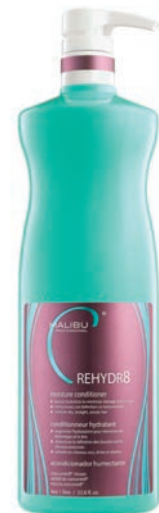
1 litre 12368