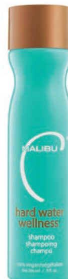
Shampoo, 266ml 15607