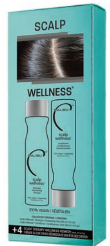
Collection (Shampoo & Conditioner + 4 Scalp Therapy sachets) 15963