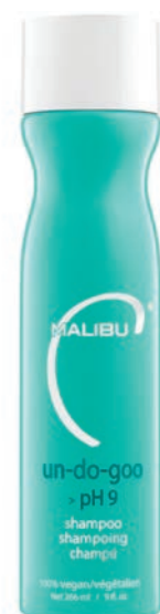
Shampoo, 266ml 15604