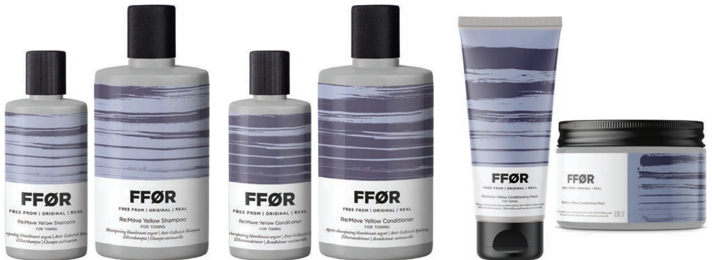
100ml 16252 300ml 16253 100ml 16254 300ml 16255 200ml 16256 500ml 16257

This intensely nourishing mask is naturally gentle on hair, while depositing powerful pigments to add brightness & neutralise yellow tones in grey, silver & blonde hair. With a blend of enriching Lemongrass, Lavender & Cedarwood, this exceptional, vegan-friendly moisturising mask helps enhance colour & promote shine for a smooth, rejuvenated finish.