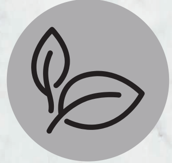
UP TO 99 NATURAL INGREDIENTS