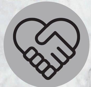
ETHICALLY SOURCED INGREDIENTS