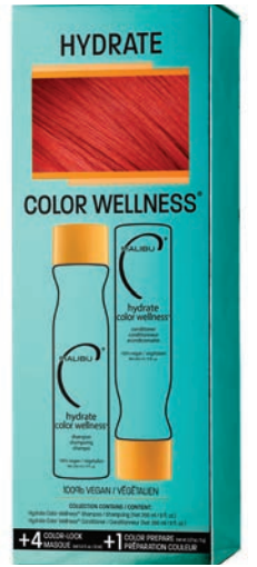
Collection (Shampoo & Conditioner + 4 Color-Lock sachets + 1 Color Prepare sachet) 15047