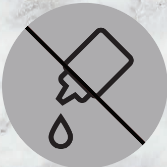
NO SYNTHETIC COLOURS