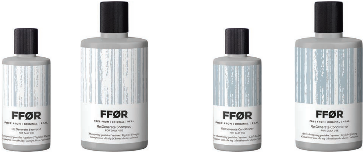
100ml 16248 300ml 16249 100ml 16250 300ml 16251

The naturally gentle & deeply moisturising conditioner, infused with organic Bergamot & Vetivert, is the perfect vegan-friendly formula for hair that needs daily care. Enriched with essential nutrients, this colour protecting conditioner is delicate enough for everyday use on all hair types, but strong enough to protect hair with a shiny, hydrated finish.