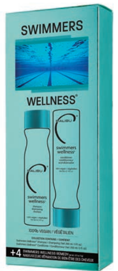
Collection (Shampoo & Conditioner + 4 Swimmers Wellness sachets) 15962