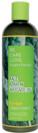
Conditioner 355ml 15650