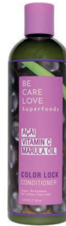
Conditioner 355ml 15653