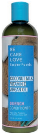
Conditioner 355ml 15652