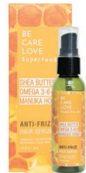
Serum 60ml 15655