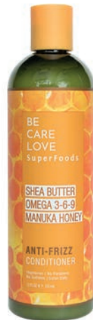
Conditioner 355ml 15651