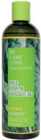
Shampoo 355ml 15646