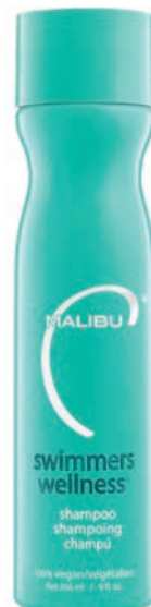
Shampoo, 266ml 15609