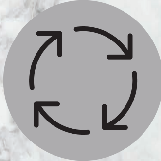
UP TO 100% PCR MATERIALS