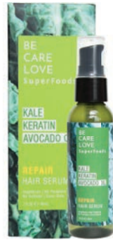
Serum 60ml 15654