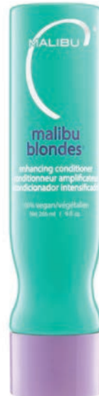
Conditioner, 266ml 15612