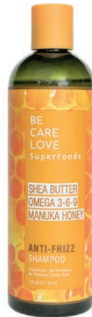
Shampoo 355ml 15647