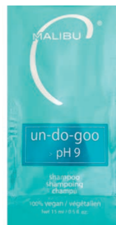
Sachet, 5g 15044