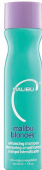
Shampoo, 266ml 15606