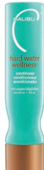
Conditioner, 266ml 15610