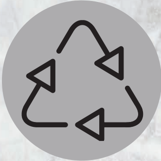
FULLY RECYCLABLE BOTTLES, JARS & LABELS