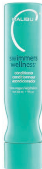
Conditioner, 266ml 15603