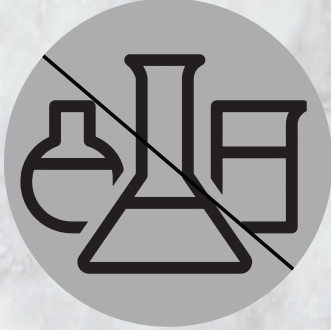
PARABEN & SULFATE FREE