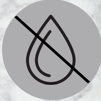
MINERAL OIL FREE