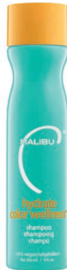
Shampoo, 266ml 15045