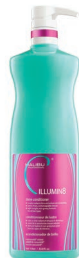
1 litre 12367