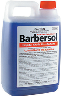
Barbersol Sanitizer Hospital-grade