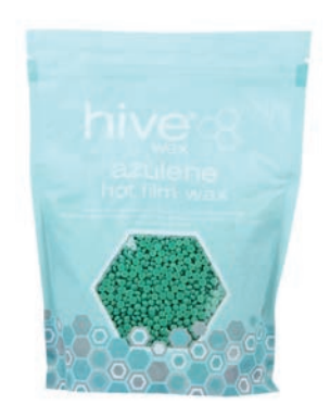
Hot Film Wax, 500g

Ensures a kind, gentle waxing experience, suitable for all skin types 14013