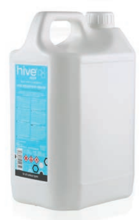
Wax Equipment Cleaner 4 Litre Economical, multipurpose equipment cleaner to clean surfaces & wax heaters 14024