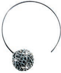
Black Diamond 8088