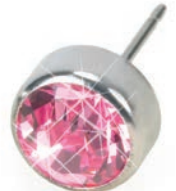
Bezel, Light Rose 6mm 8006