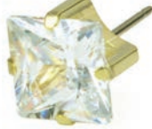
Tiffany square CZ white 7mm 7998