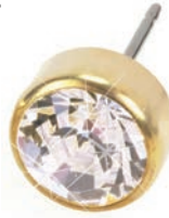
Bezel crystal 8mm 7999