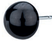
Black Titanium 10348