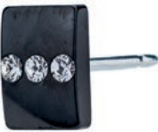
Black Titanium 10353