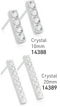
Crystal 10mm 14388