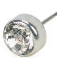
Bezel, Crystal 6mm 8004