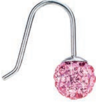
Light Rose 10344