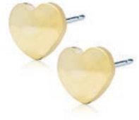
Gold Titanium 8mm 14391