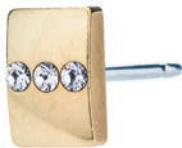
Gold Titanium 10352