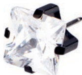
Tiffany Square CZ White 7mm 8001