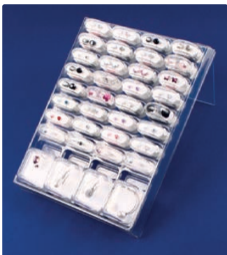
16 piece plastic display (Excludes earrings) 8469