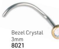
Bezel Crystal 3mm 8021