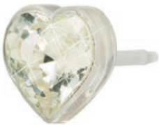
Heart Rose 6mm 8011