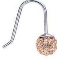
Golden Rose 10345