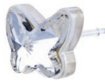
Butterfly Amethyst 9mm 8019