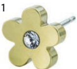
GOLD TITANIUM Crystal Flower 8mm 9001