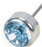
Bezel, Alexandrite 6mm 8005