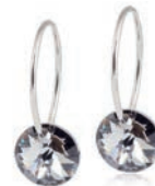
RING BLACK DIAMOND Round 8mm 14386