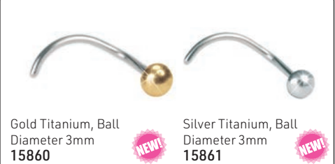
Gold Titanium, Ball Diameter 3mm 15860