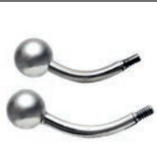
Barbell 10mm 8198