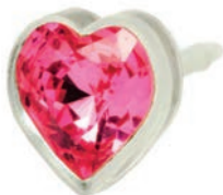
Heart Ruby 6mm 8012