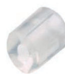
Jewellery stopper for hanging jewellery 8034