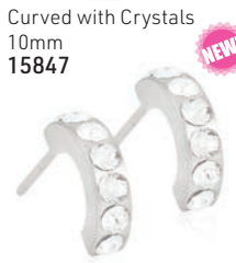
Curved with Crystals 10mm 15847