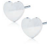
Silver Titanium 8mm 14390