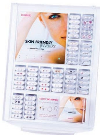
60 Piece counter display, Anti theft device mechanism (Excludes earrings) 8078