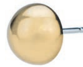
Gold Titanium 10349