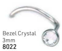
Bezel Crystal 3mm 8022