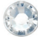
Crystal 8mm 8199