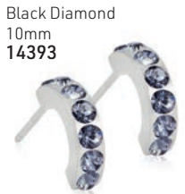
Black Diamond 10mm 14393