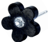
BLACK TITANIUM Crystal Flower 8mm 9003