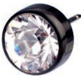
Bezel Crystal 6mm 8000