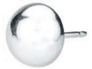
Silver Titanium 10350