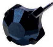
Tiffany Jet Hematite 9mm 8003