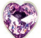
Heart light amethyst 12mm 8202