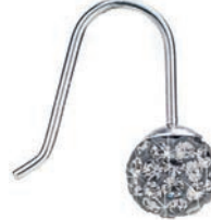
Black Diamond 10346