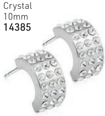
Crystal 10mm 14385