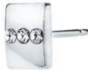
Silver Titanium 10351