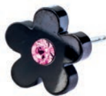
ROSE TITANIUM Crystal Flower 8mm 9610