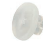
Medical plastic clasp 8033