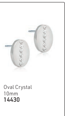
Oval Crystal 10mm 14430