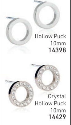
Hollow Puck 10mm 14398