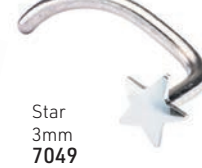
Star 3mm 7049