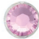
Light Rose 8mm 8201