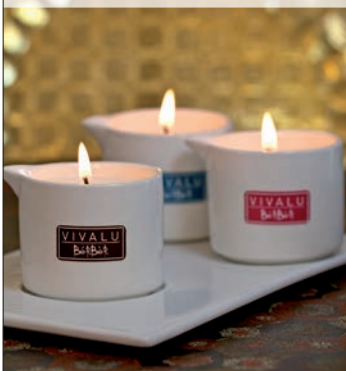
Vivalu Berber Argan cosmetic candle

He (male) 7889 She (female) 7888 Unisex 7890