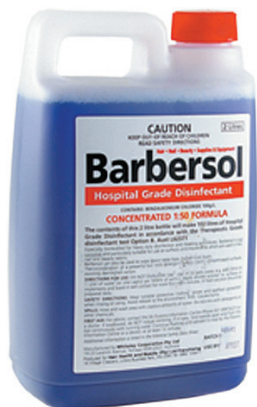
Barborsol Sanitizer Hospital-grade