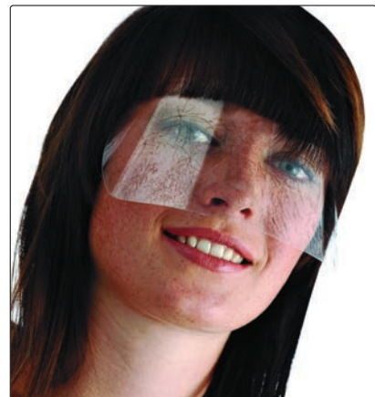
Disposable visor for treatments & cutting, 30/pkt 6041

BRASIL CACAU's aftercare products ensure long-lasting results, up to 3 to 4 months.