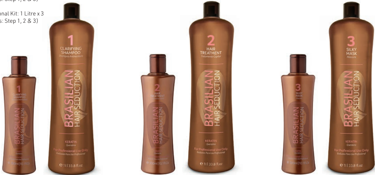
Step 1: Brazilian Hair Seduction Clarifying Shampoo 300ml P946 Clarifying Shampoo 1 Litre P951