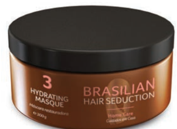
Brazilian Hair Seduction Hydrating Masque 200g 13363